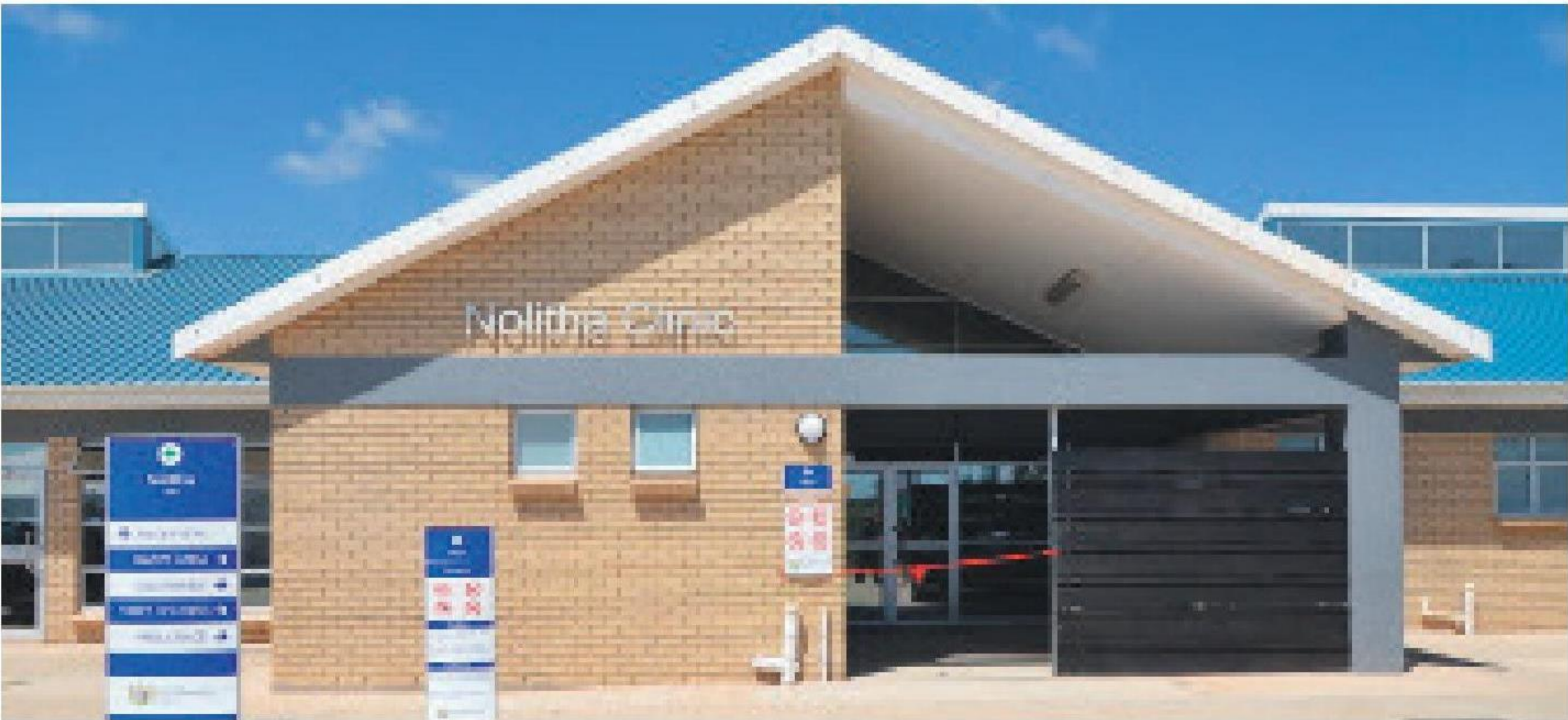
NHI Programme: one of the eight successfully completed NHI Clinic's by Coega.

Given the aforementioned success, Coega has been asked by the other countries in the continent to help with the development of their infrastructure programmes. This is the first public entity, as far as we know, that has been asked by these countries for help, and they include Zimbabwe to develop Norton and Ecosoft SEZs in Harare; Central African Republic logistics base concession in Cameroon; and in Nigeria providing technical advisory services and co-development partnership.