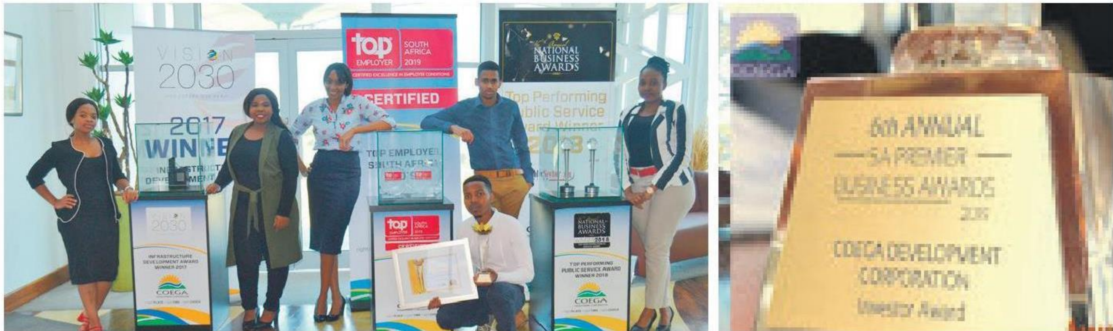
CDC Head Office: some of the accolades received by Coega including its commitment to achieving NDP 2030 vision.

Moreover, Coega as a government asset, is a symbol of success, and the Department of Trade, Industry and Competition’s ( the dtic’s ) pride and joy in terms of the SEZ programme. It is arguably the most successful Special Economic Zone and infrastructure development public entity in South Africa. It has won numerous prestigious awards, i.e., the 2019 Investor of the year award by the dtic , Proudly South African and Brand South Africa, amongst others. “The SEZ programme is one of the strategic tools for industrialisation, promotion of investments and exports, as well as creation of the much-needed jobs, especially for the youth.