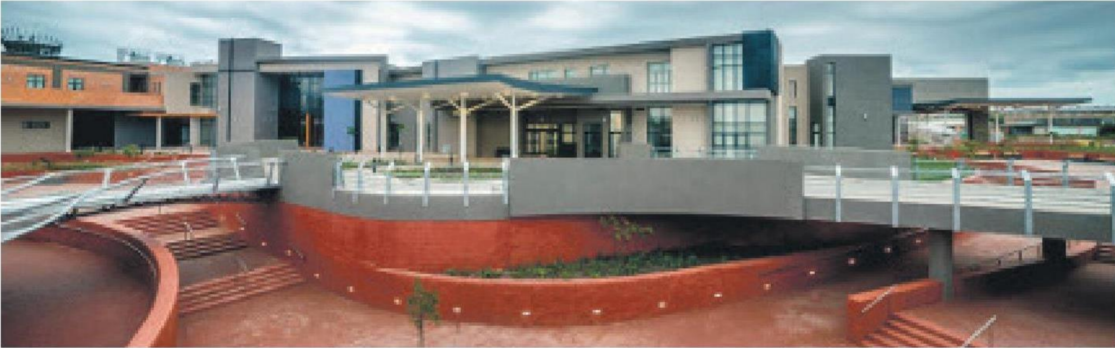
Mega Infrastructure: Cecilia Makiwane, one of the largest projects built post democratic dispensation. The project created in excess of 3 606 much needed jobs & provided skills development and training to the local communities.

Coega’s achievements extend to the Eastern Cape Province where it has successfully built Hospitals, Clinics, and Schools infrastructure. Some of these projects include, but not limited to, the completed R1 billion Cecilia Makiwane Hospital, a mega infrastructure project. Cecilia Makiwane Hospital is a large, provincial, government-funded hospital situated in the Mdantsane township of East London, Eastern Cape in South Africa. It is a tertiary teaching hospital and forms part of the East London Hospital Complex.