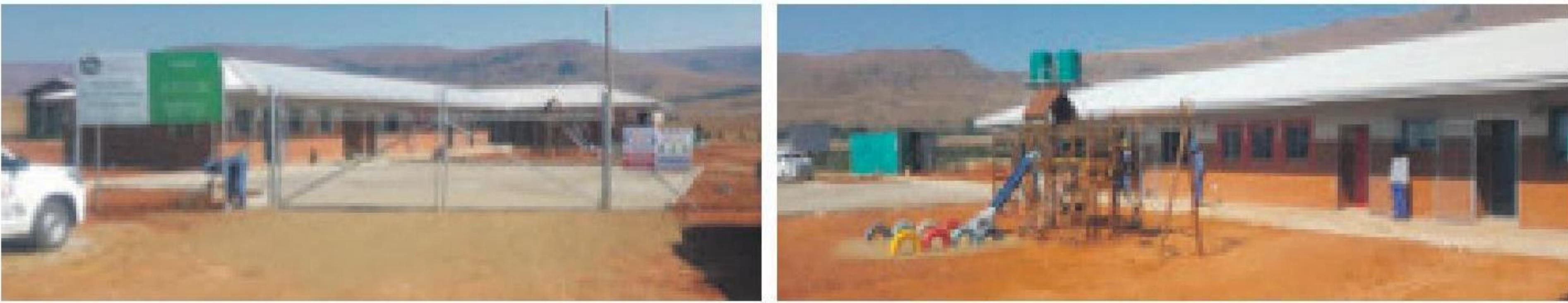
Dlamlenze Early Childhood Development Centre in the Amajuba District in KZN.

Some of the KZN projects included the Department of Social Development (DSD) projects. The portfolio focused on the planning, execution, implementation and management of the DSD infrastructure projects, including the construction of Service Offices, Early Childhood Development Centres, and upgrading, renovation, repairs, maintenance and additions to existing buildings at identified sites throughout the province.