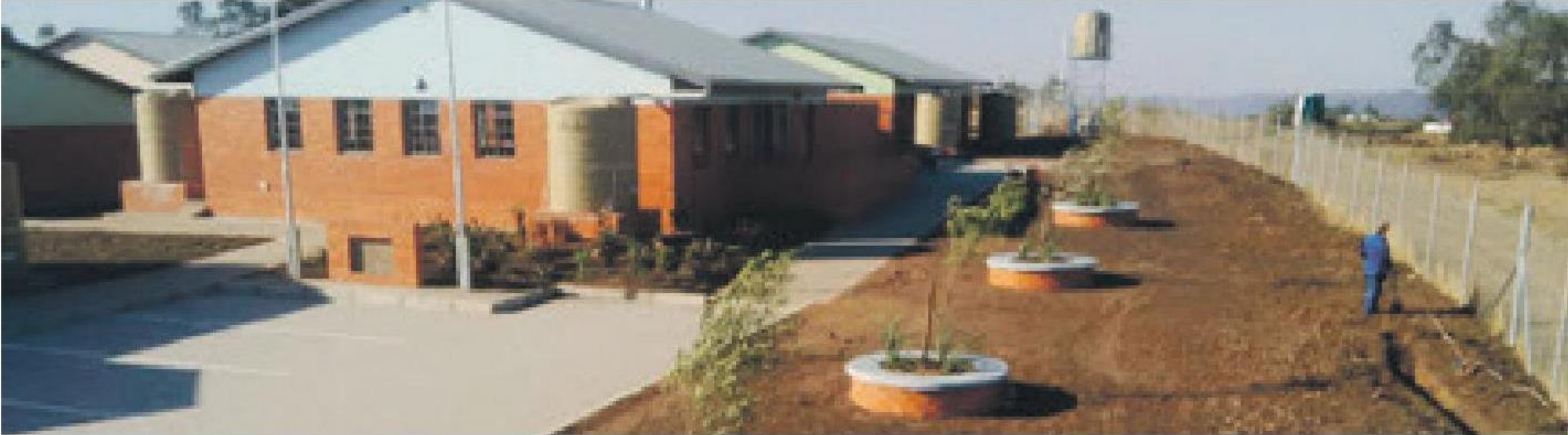
Nurturing the Future: Madlalisa Senior Primary School in Ntabankulu Local Municipality opened its doors to hundreds of learners in 2017.

Another notable project is the delivery of a multimillion rand school at Ntabankulu Local Municipality. Learners of Madlalisa Senior Primary School (SPS), in 2017, commenced their school programme in a newly built school, thanks to the partnership between the ECDC and Coega. The project saw the installation of eight (8) new classrooms, computer lab, science laboratory, resource centre, multipurpose and nutrition centres. The project formed part of the successful completion of over twenty-one (21) Accelerated Schools Infrastructure Delivery Initiative (ASIDI) projects by Coega.