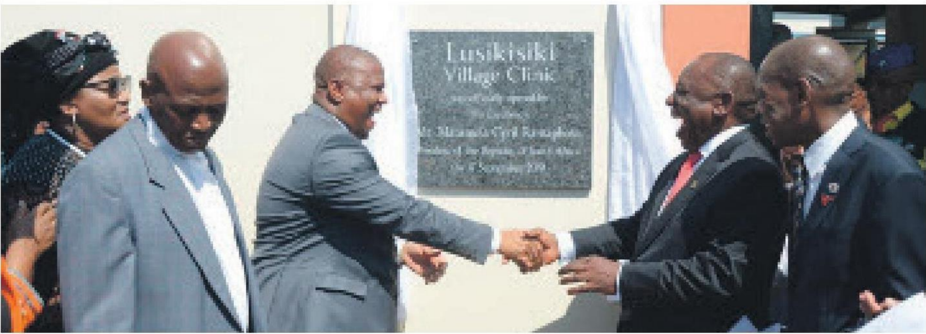
Model of Success: H.E. President Cyril Ramaphosa joined by the Minister of Health, Dr. Zweli Mkhize, and Premier of the Eastern Cape, Oscar Mabuyane & EC Health MEC, Sindiswa Gomba at the opening of the NHI Lusikisiki Clinic in 2019.

Following the introduction of the National Health Insurance (NHI) programme, spearheaded by the National Department of Health (NDoH), Coega has been at the forefront of implementing eight (8) successful projects in the Eastern Cape Province. The eight (8) completed projects are located in the OR Tambo NHI Pilot district of the province of the EC, valued at R289 million and have created in excess of 790 jobs.