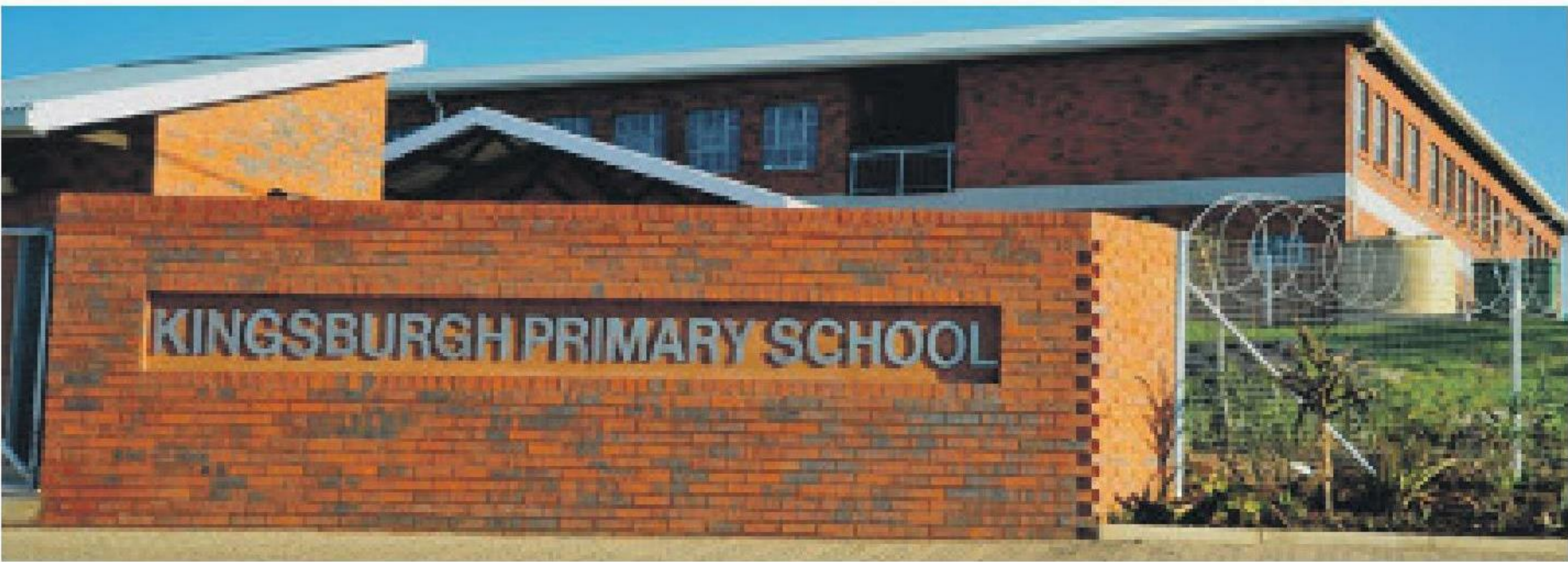
Completed Project: Kingsburgh Primary School in the KZN Province.

Some of these include Glengarry Primary School; Goodhome Secondary School; Hhoye Secondary School; Mbongeleni Primary School; Umsilinga Primary School; Ebuhlenibenkosi Secondary School; Westmead Secondary School; Khindi Jobe Primary School and Ukhanyakomsinga Special School, to mention but a few.