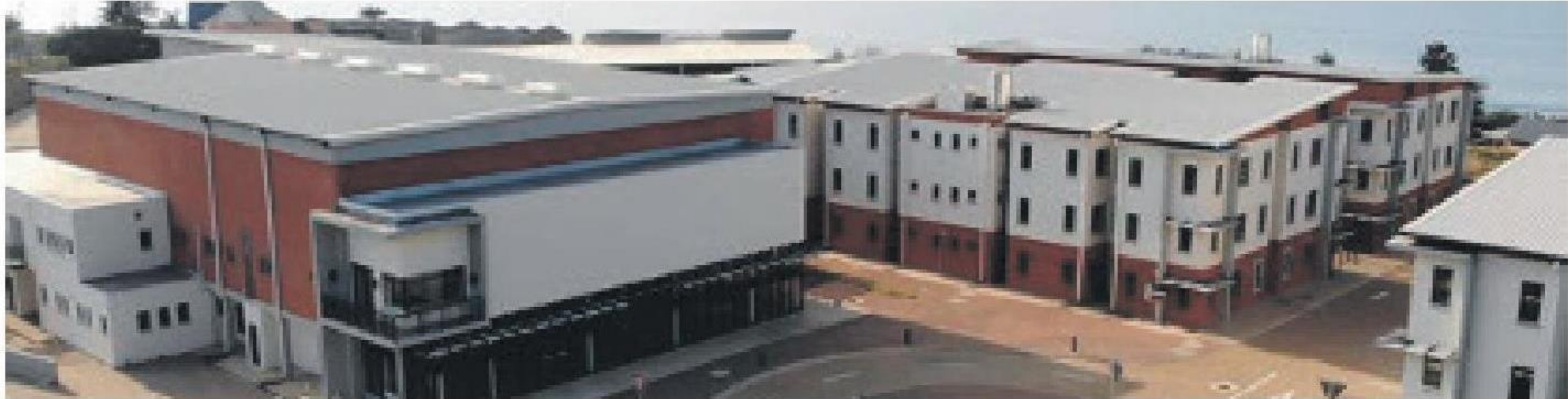
Anton Lembede Maths, Science & Technology Academy: La Mercy in KwaZulu-Natal.