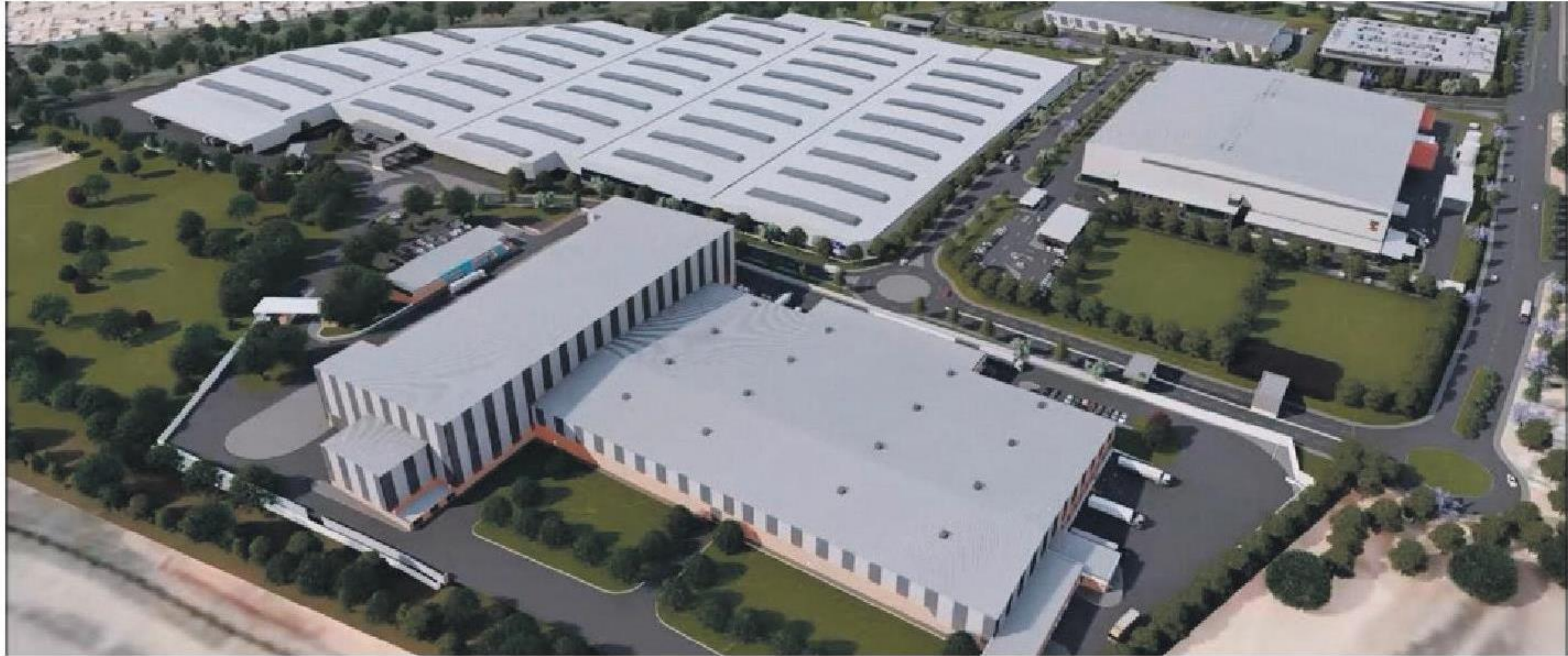
Artist Impression: Site Construction

The TASEZ project is implemented in collaboration with the City of Tshwane, the Department of Trade, Industry and Competition, and Gauteng Government.