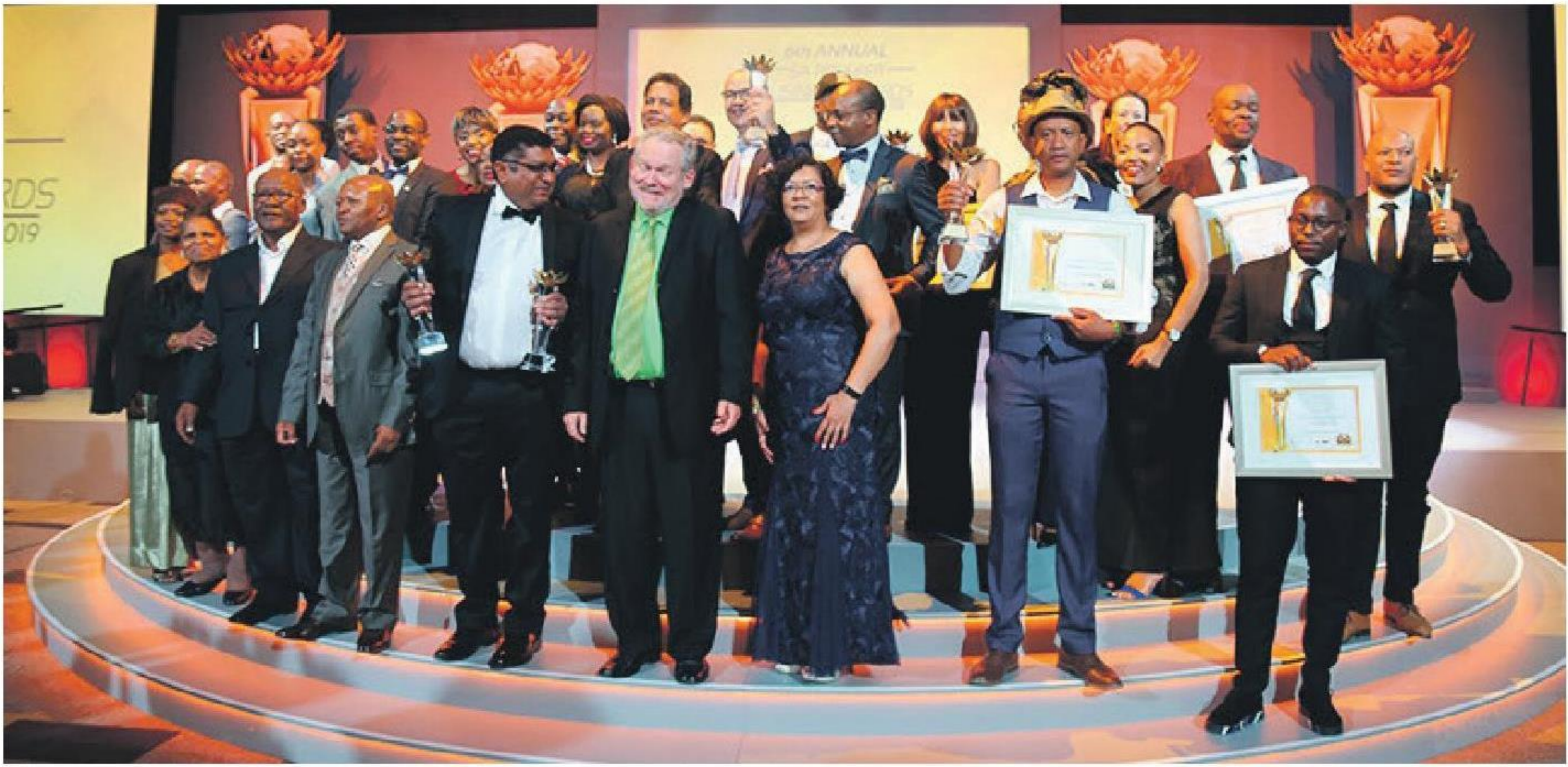
The winners of the 6th Annual South African Premier Business Awards by the dtic . The awards were announced in March 2019 at the Sandton Convention Centre, Johannesburg. Coega won the Investor of the Year Award.

Coega has in its employ highly experienced civil engineers, professional service providers, project accountants, and programme managers, some of whom have PhDs and are experts and thought leaders in the various fields; these are the people who have been instrumental to the success of Coega and can be utilised to meet the objectives of the investment and infrastructure office in the presidency and other government departments.